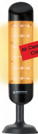
Air Cleanliness Class 1