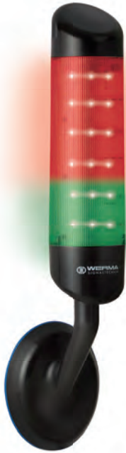
The colours red, yellow and green can be set via DIP switch for any required order or distribution